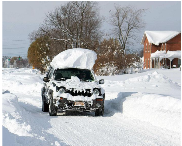
Driving with snow on your rooftop or obstructing your view is dangerous - and could lead to a ticket.

Members of the Mendon Madness and Sutherland SuperFans teams encourage friends, families and all others to support their efforts by donating online on their behalf to Special Olympics at http://polarplunge.net . Pittsford students have generated more than $20,000 in donations for Special Olympics over the past five years, providing year-round opportunities for athletic competition to over 3,600 individuals in the Genesee Region.